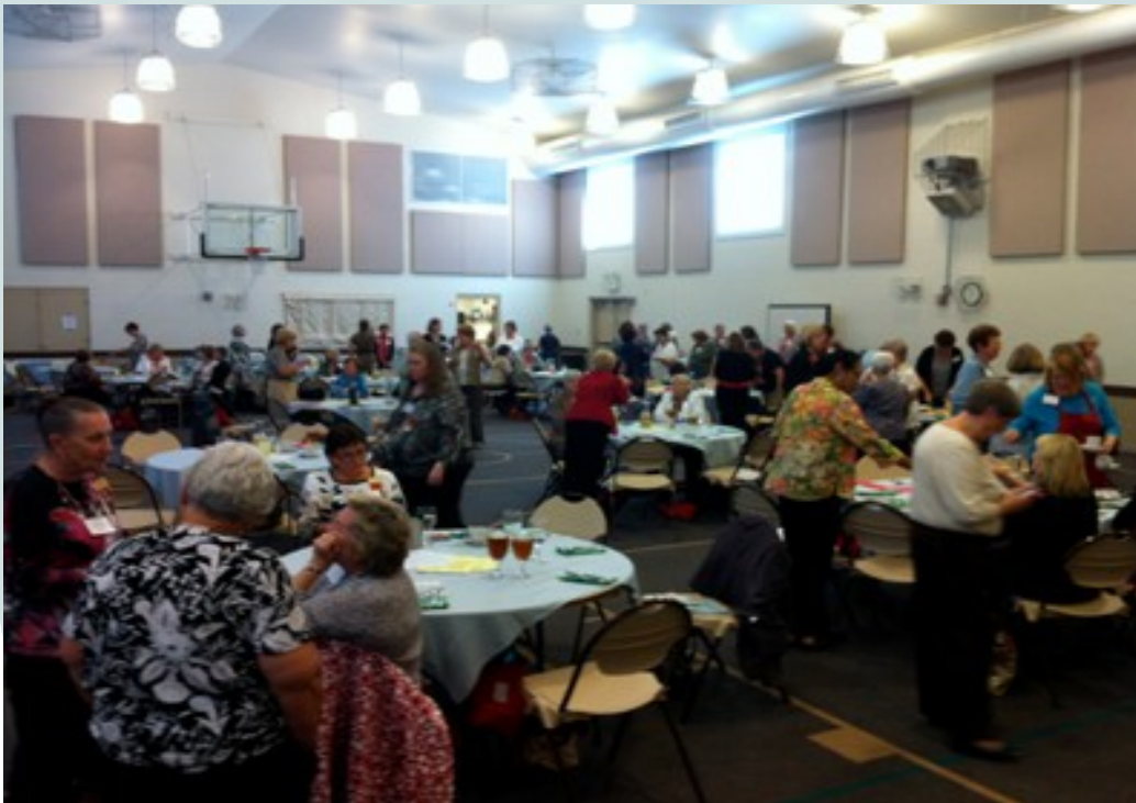
Dozens of chapter presidents from Indiana enjoyed sharing the business of Delta Kappa Gamma at the State Board meeting at Emmanuel Methodist Church in Noblesville on September 8.