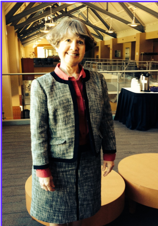
Pi Chapter News